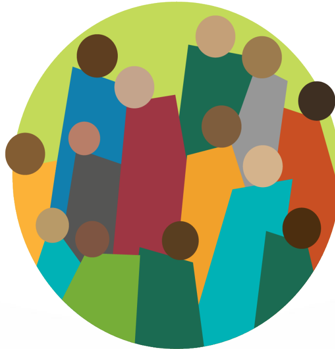
Driven by Equity