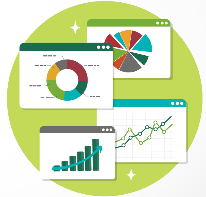
Backed by Data